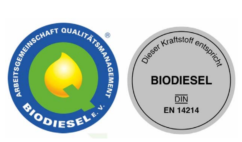
Figure 1: Labels for biodiesel in Germany after AGQM (left) and DIN EN 14214 (right)

For gaining a higher public recognition in Germany biodiesel fuel pumps are labelled after DIN EN 14214. Additionally fuel pumps may also be marked by the German AGQM label (Figure 1).